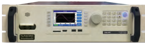
500VA, 750VA & 1200VA Models