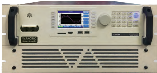
Model 320LMX - 2000VA