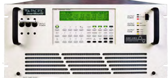
Model 320AMX - 2000VA

Pacific Power Source is pleased to announce the release of the new LMX Series of high performance linear AC power sources. The LMX Series is a direct replacement for Pacific's legacy AMX Series of linears but offers many enhancements and improvements over the older model generation. The table below list some of the key similarities and differ-