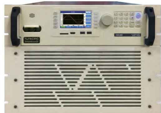
4500VA & 6000VA Models